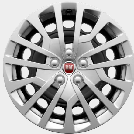
17" black steel wheels with fullsize hubcap