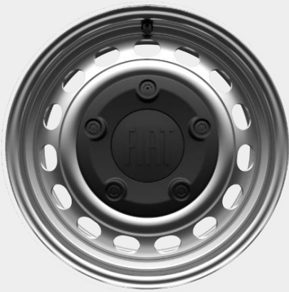
16" steel wheels with half hubcap